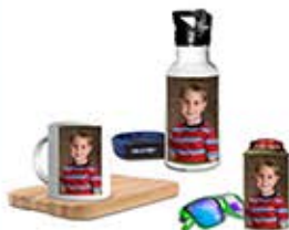
Drinkwear Mugs, Water Bottles