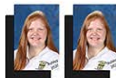
(2) 3x5 Personalized Magnets