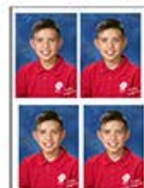
NAME YEAR 4-Wallets Personalized