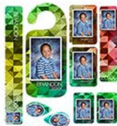
Multi-Color Fun Pack