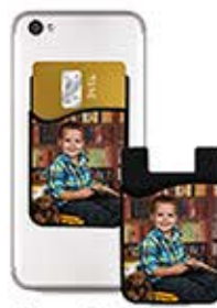
Phone Card Caddy